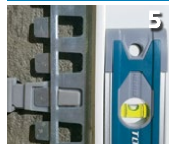
5 Level corner on both sides