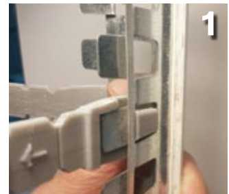
1 Connect the Clip with click