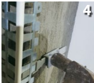
4 Hammer clip into the wall