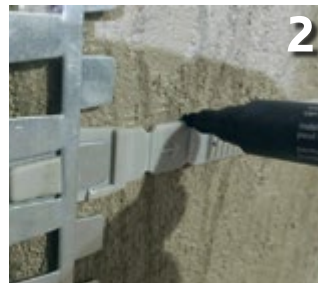
2 Mark drill holes