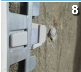
8 Remove the Clip